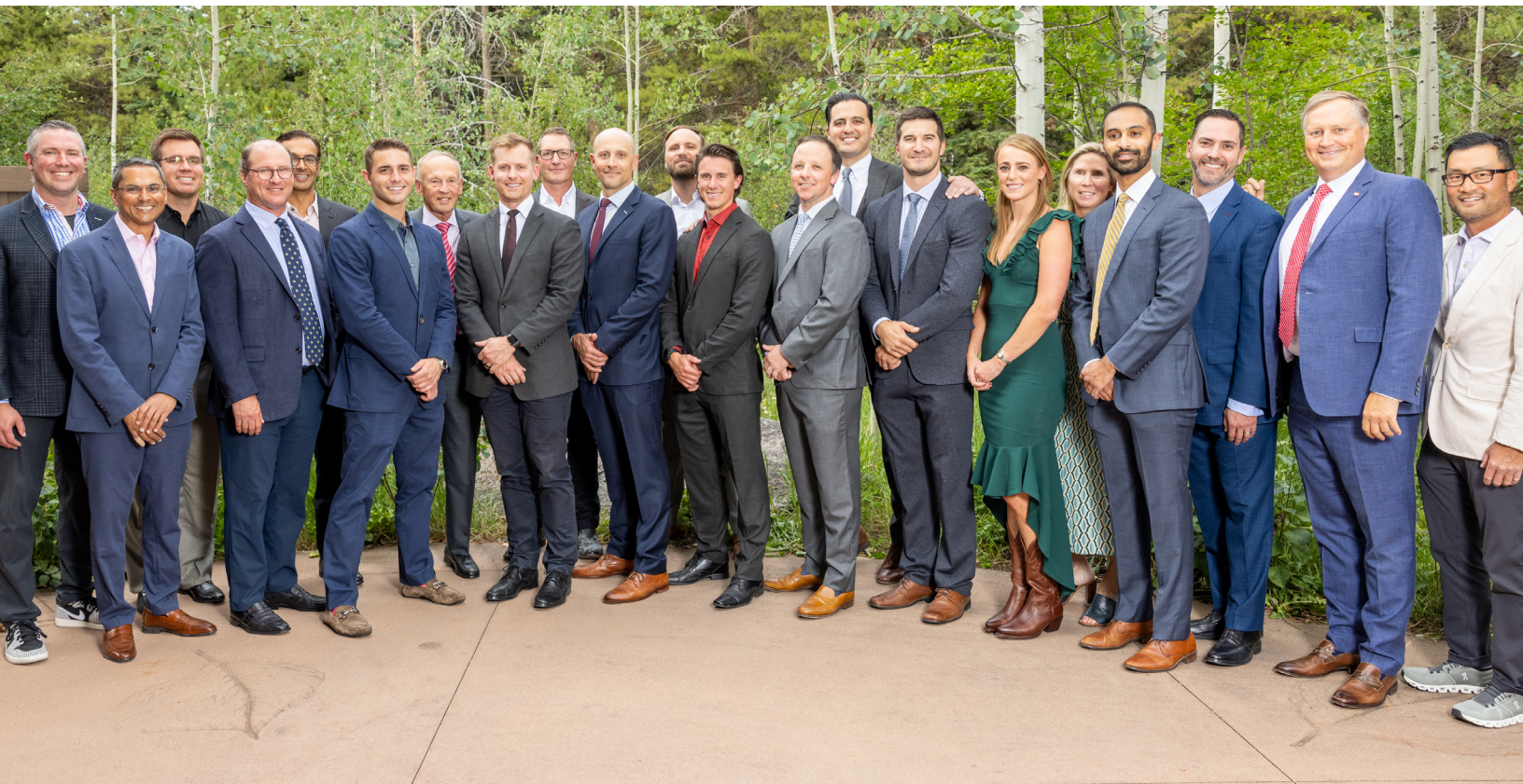
The 2023–2024 Fellowship Class with several physicians and faculty members from The Steadman Clinic